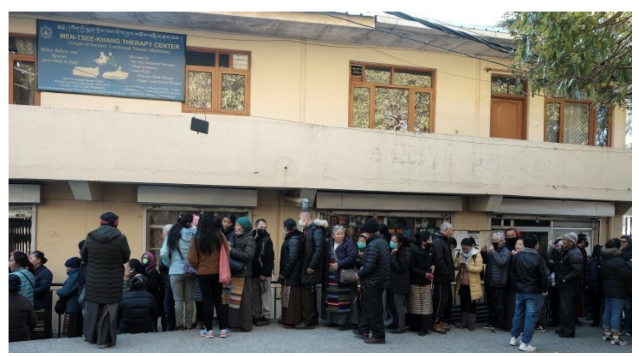
1. Tibetans lining up for rimsung ('infection protective') pills, which are worn as amulets, at the Men-Tsee-Khang (MTK) branch clinic in McLeod Ganj, 8 February 2020.

COVID-19, anthropology of epidemics, Tibetan medicine (Sowa Rigpa), Tibetan diaspora, coronavirus