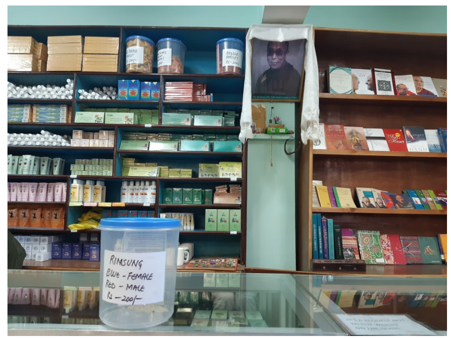
4. Rimsung amulets are sold out at the MTK shop in McLeod Ganj, 8 February 2020.

In the MTK shop, the box containing amulets is empty (fig. 4); the amulets were sold out the previous day. During the fifteen minutes I spend in the shop, four Tibetan customers walk in asking for the amulet, which sells for two hundred rupees (approx. US $3).