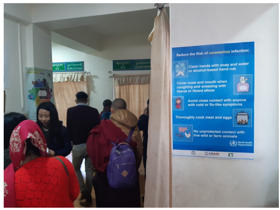
8. A Department of Health (Central Tibetan Administration) poster, following WHO guidelines, at an MTK clinic selling Tibetan medicines.

'Science' and 'tradition' mingle in public health efforts to inform Tibetans in exile about preventive measures (fig. 8). Tibet TV streams two thirty-minute shows, in Tibetan and English, each with a biomedical and a traditional Tibetan physician discussing prevention of coronavirus (Tibet TV 2020a, 2020b). While the biomedical doctors present standard WHO advice on hygiene, washing hands, coughing in one's sleeve, wearing masks, and so on, the Tibetan physicians primarily draw on the Four Treatises , which has designated chapters on infectious diseases, gives dietary and behavioral advice, and lists formulas to prevent and treat epidemics.