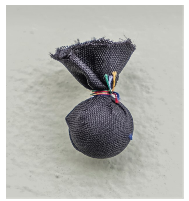
2. A rimsung pill, based on a medicinal formula, but worn as an amulet.

Jigme has a handful of Tibetan pills wrapped in black cloth and tightened with five-colored strings lying on his table; he gifts me two for protection from an emerging epidemic, at that moment still largely confined to China. In Tibetan, they are called rimsung rilbu (Tib. rims srung ril bu ), meaning 'pills that protect from contagion' (fig. 2).