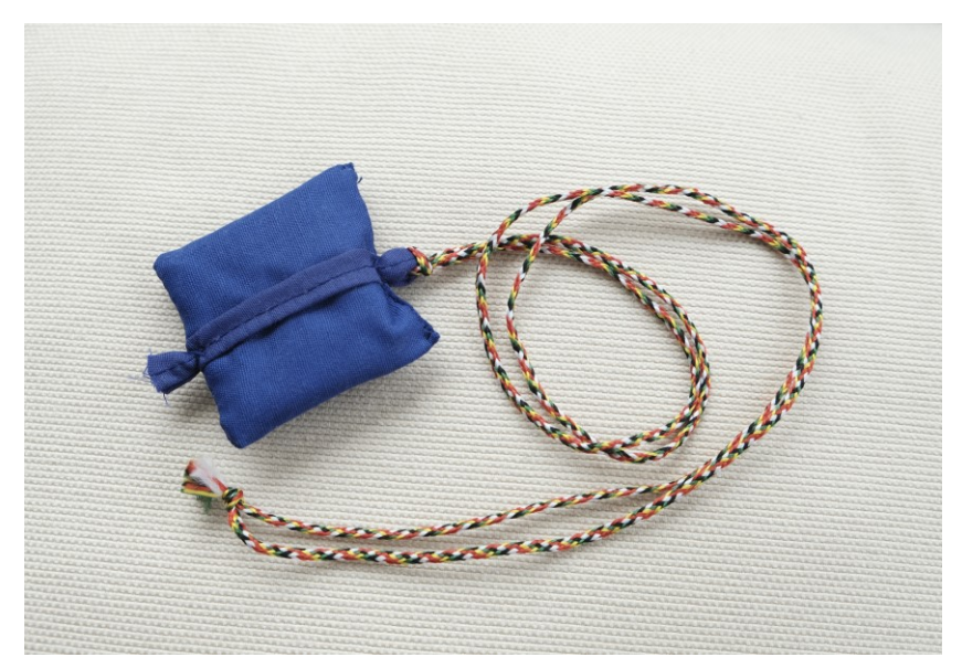
3. The blue-colored Tibetan rimsung amulet (for women) to protect from epidemics.

Jigme then shows me a short video clip on WhatsApp, depicting a crowd of more than fifty Tibetan monks, nuns, and laypeople, some of them wearing facemasks, queuing in front of the MTK clinic that same morning, waiting to buy their two rimsung pills. The next day, I observe a similar-sized queue of Tibetans gathering before the MTK branch clinic in McLeod Ganj (fig. 1); by 10am, the entire stock of 2,500 rimsung pills is sold out. The MTK shop next to the clinic, which sells MTK supplements, tea, incense, and books, also offers an astrological rimsung amulet. It is a cloth-covered square sachet (red for men and blue for women) containing mantras and potent substances. It has a five-colored string and is worn around one's neck (fig. 3).