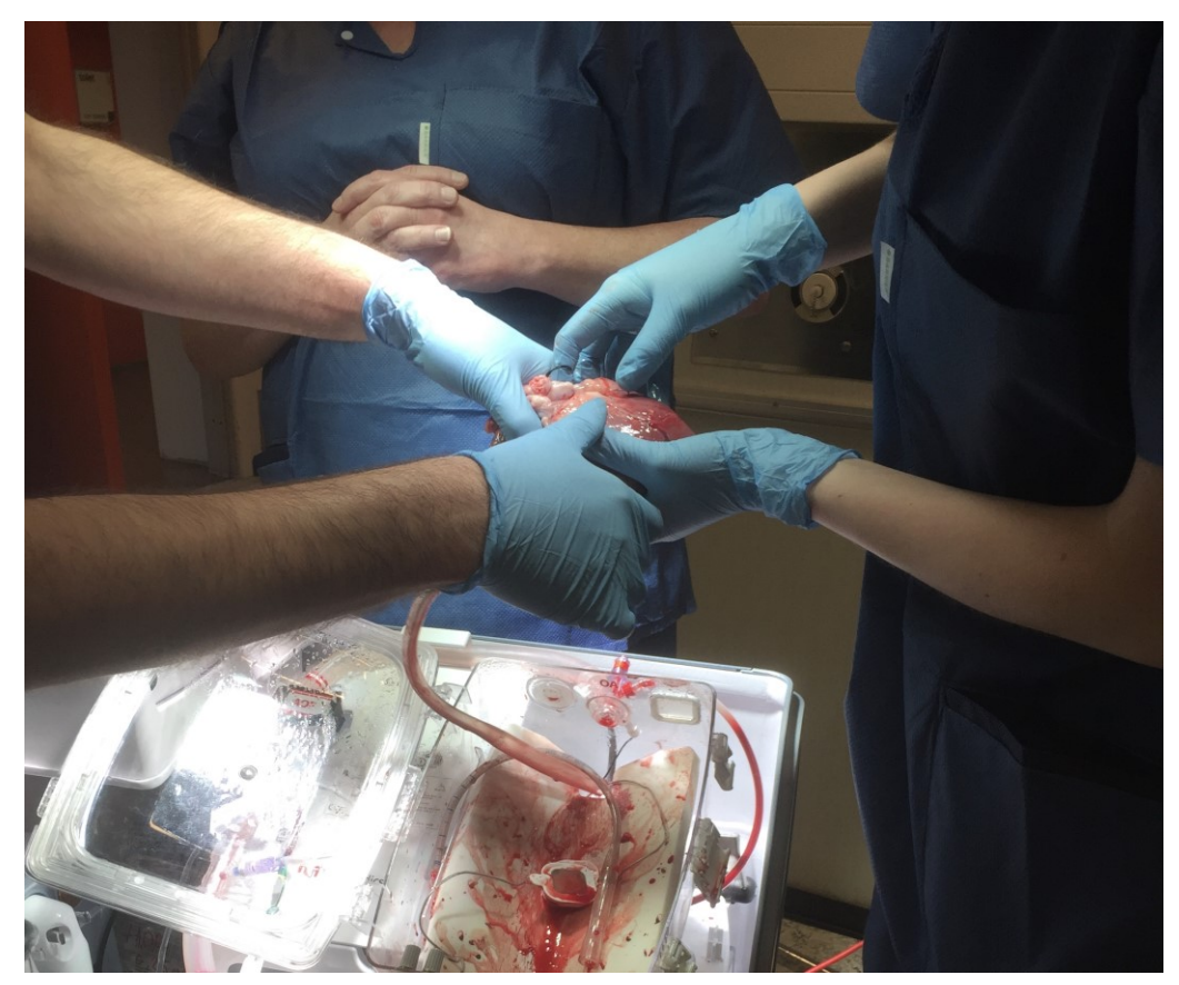
2. The pig heart and the ex vivo machine.

The ambition of all above-mentioned experiments was not only to ensure readiness for DCD organs but also to ensure that 'damaged' organs from so-called 'marginal' donors otherwise unsuitable for transplant due to donor age or medical history could be 'improved' and safely considered. In these experiments, pigs modelled both human donors and recipients and were crucial for improving the pre-existing practices, realising current potentials, and paving the way to a future where all donated organs can be technologically or genetically improved.