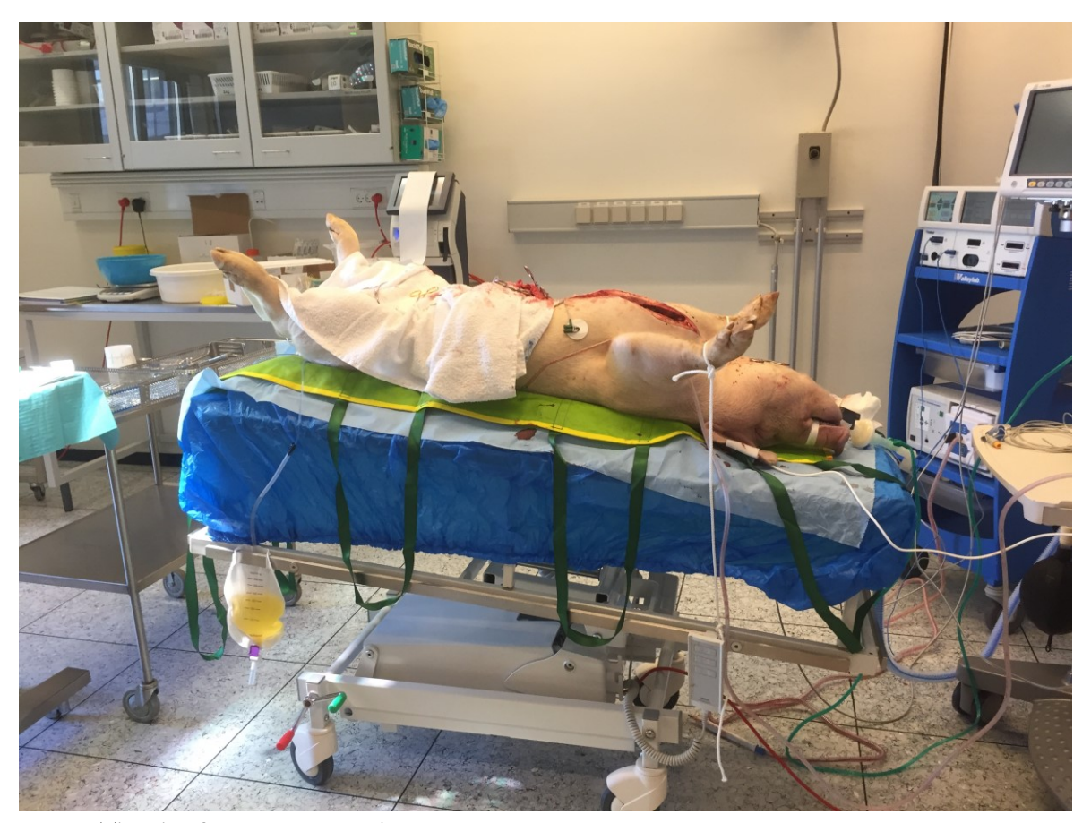
6. The pig after organ removal.

Somehow it reminds me of watching a deceased human organ donor having organs removed. That's also disturbing somehow. I have participated a few times [in human organ procurement]. You get in a really sad mood. Because you can still see that this used to be a human being until very recently. And now it's lying there, completely empty. You can see that it makes sense, but you have to handle it with grace and sensitivity.