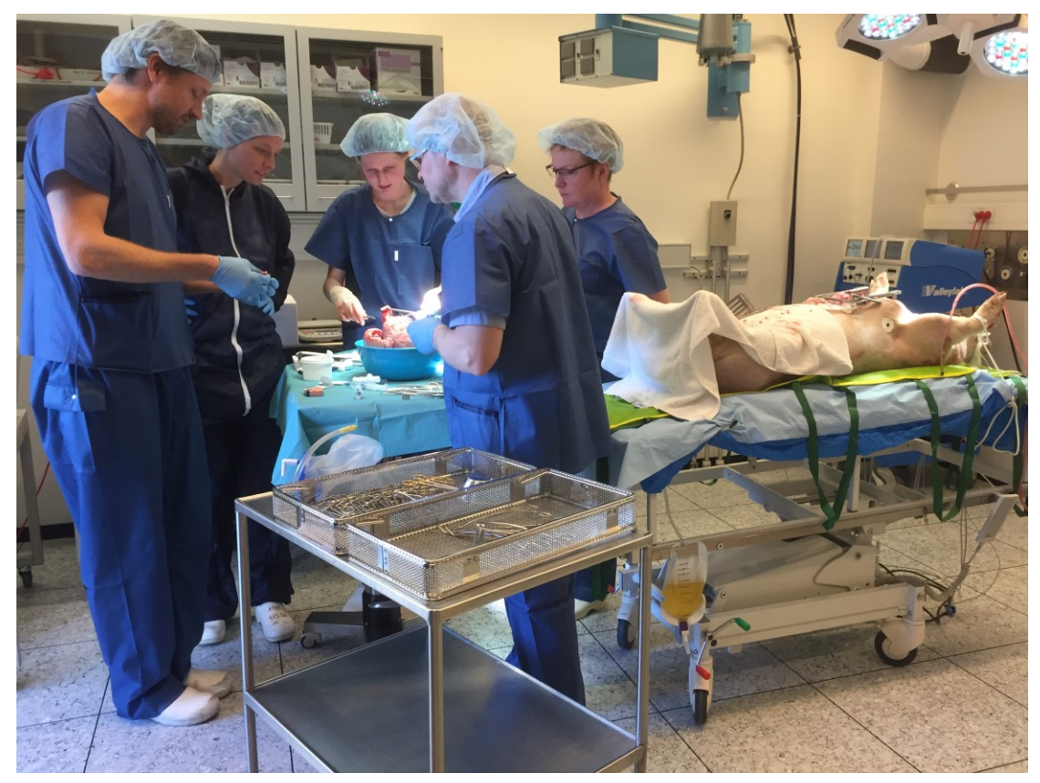
1. Transplant professionals working in the lab

Organ transplantation, Animal experiments, Laboratory research, Intimacy, Denmark, Science and technology studies