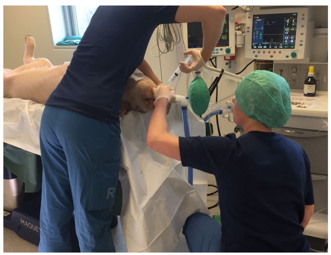
7. Preparing the pig for surgery.

For this kind of research, you have to think it all through yourself. What instruments to use, the size of the intubation tube—you have to make many decisions. In a way, that's really good, because if you're going to be a surgeon someday, which I might be, then you get a better understanding about the other professions—what it means to intubate, what it means to be sterile and prepare an operating room before the patient arrives.