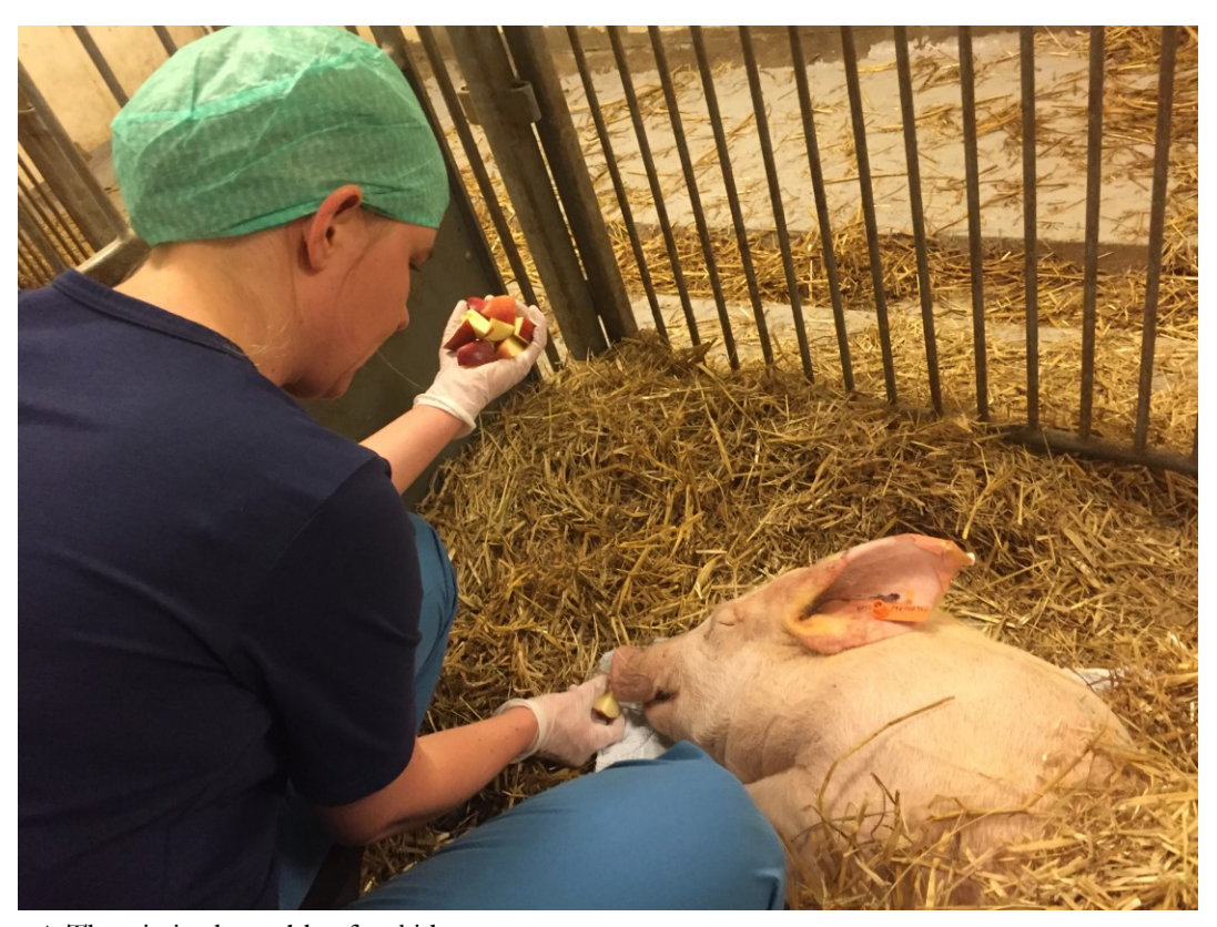
4. The pig in the stable after kidney surgery.