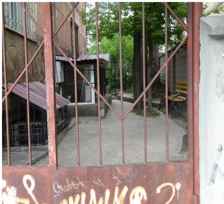
5. Locked entrance to HIV service agency in Crimea

HIV service agencies were open only during working hours. After hours, buildings were locked up (photograph 5), and services were delivered through mobile clinics or late-night pharmacies, resulting in an ever-changing map of services in a given city. And there was a constant threat that these daily closures could be made more permanent. Since the annexation by Russia of the Crimean Peninsula in 2014, some of the services provided by HIV service agencies, like opioid agonist treatment, are now illegal; others, like syringe distribution, are not supported. As political, economic, and social climates shift, the therapeutic landscapes previously nurtured in many of these spaces can no longer be tended, exposing the precarity of both the agency staff and clients, who are left without salaries and harm-reduction supplies.