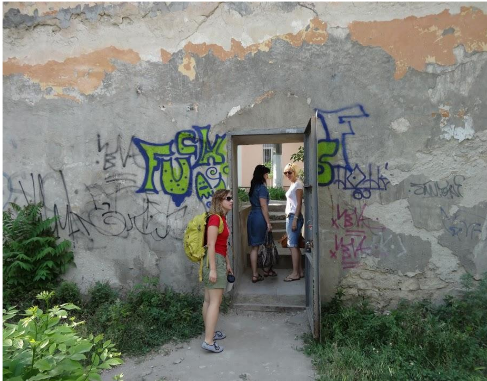
2. Entrance to the regional AIDS center in Mykolaiv