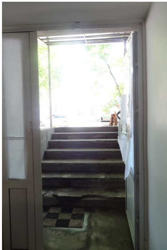
1. Stairway down to HIV service agency in Mykolain

In the context of entrenched stigma and discrimination towards at-risk populations such as people who use drugs and commercial sex workers, HIV-prevention efforts in Ukraine have been driven underground. Many HIV service agencies were located unobtrusively in basements with minimal signage (photograph 1). In these hidden spaces, agency staff struggled to create a safe, supportive environment for clients, and provide them with harm-reduction supplies (such as sterile syringes and condoms) and knowledge about safer injecting that would allow clients to better protect themselves from HIV and other diseases. Yet, temptations and risks for clients were immediate. As a space where drug users gathered and harm-reduction services were provided, agencies attracted drug dealers and invited police surveillance, leading to incidents of violence, bribery, and the destruction of harm-reduction supplies by police (Booth et al. 2013). Agency staff navigated their own emplaced precarity in these spaces. Their sense of success in helping people was fragile since, right across the street from the agency, they often saw clients approaching drug dealers or being hassled by police as soon as they left. As staff ushered clients up the stairs like those pictured in photograph 1, clients emerged to new possibilities and new risks.