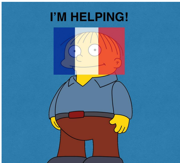
Figure 2. A picture of Ralph Wiggum, a character on the television show The Simpsons , with the French flag superimposed. This image was distributed through sites like Reddit as a criticism of the 'slacktivism' of Facebook users who, as a sign of solidarity, added the French flag to their profile pictures using a filter provided by Facebook.