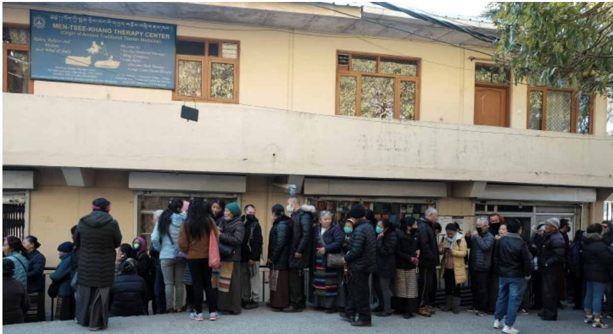
1. Tibetans lining up for rimsung ('infection protective') pills, which are worn as amulets, at the Men-Tsee-Khang (MTK) branch clinic in McLeod Ganj, 8 February 2020.

COVID-19, anthropology of epidemics, Tibetan medicine (Sowa Rigpa), Tibetan diaspora, coronavirus