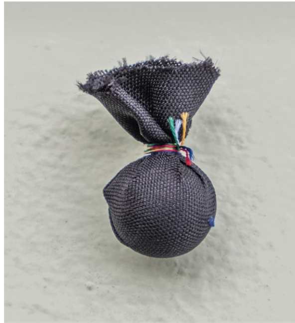
2. A rimsung pill, based on a medicinal formula, but worn as an amulet.

Jigme has a handful of Tibetan pills wrapped in black cloth and tightened with five-colored strings lying on his table; he gifts me two for protection from an emerging epidemic, at that moment still largely confined to China. In Tibetan, they are called rimsung rilbu (Tib. rims srung ril bu ), meaning ‘pills that protect from contagion’ (fig. 2).