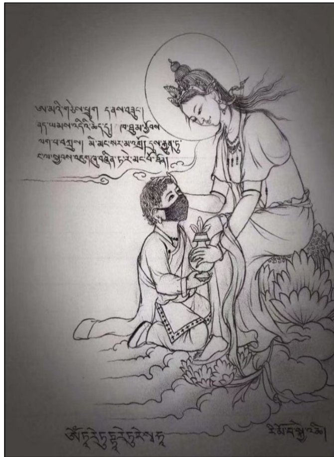
7. An awareness-raising call in Tibetan to wear facemasks and recite mantras, circulated on social media (see Thubten Phuntsok and McGrath 2020). The translation by McGrath reads: ‘My beloved child, from now on wear a mask, wash hands, don’t go into crowded places, and recite mantras’.

Facemasks have been described by anthropologists as both ‘potent symbols of existential risk’ and as ‘indispensable technology against epidemics’, thus combining symbolic with practical medical reasoning (Lynteris 2018, 442). Wearing a mask and chanting mantras, though based on different epistemologies, do not contradict each other in Tibetan responses to COVID-19 (fig. 7); rather, they are part of the multivalent resources that people mobilize to feel protected.