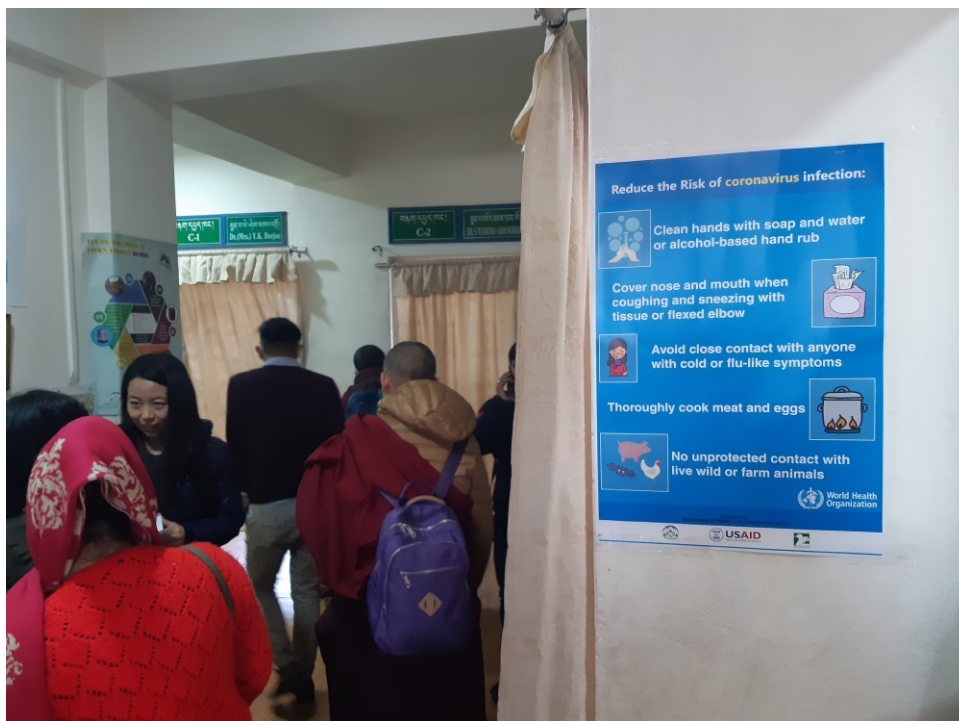
8. A Department of Health (Central Tibetan Administration) poster, following WHO guidelines, at an MTK clinic selling Tibetan medicines.

‘Science’ and ‘tradition’ mingle in public health efforts to inform Tibetans in exile about preventive measures (fig. 8). Tibet TV streams two thirty-minute shows, in Tibetan and English, each with a biomedical and a traditional Tibetan physician discussing prevention of coronavirus (Tibet TV 2020a, 2020b). While the biomedical doctors present standard WHO advice on hygiene, washing hands, coughing in one’s sleeve, wearing masks, and so on, the Tibetan physicians primarily draw on the Four Treatises , which has designated chapters on infectious diseases, gives dietary and behavioral advice, and lists formulas to prevent and treat epidemics.