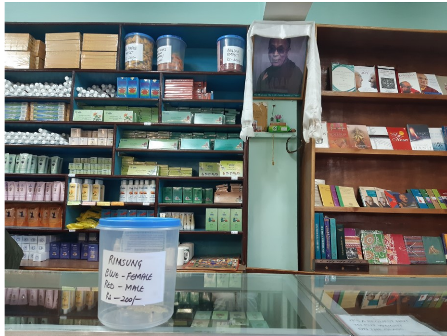
4. Rimsung amulets are sold out at the MTK shop in McLeod Ganj, 8 February 2020.

In the MTK shop, the box containing amulets is empty (fig. 4); the amulets were sold out the previous day. During the fifteen minutes I spend in the shop, four Tibetan customers walk in asking for the amulet, which sells for two hundred rupees (approx. US $3).