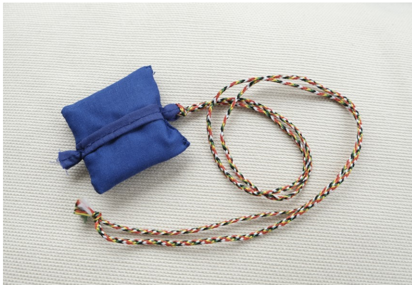
3. The blue-colored Tibetan rimsung amulet (for women) to protect from epidemics.

Jigme then shows me a short video clip on WhatsApp, depicting a crowd of more than fifty Tibetan monks, nuns, and laypeople, some of them wearing facemasks, queuing in front of the MTK clinic that same morning, waiting to buy their two rimsung pills. The next day, I observe a similar-sized queue of Tibetans gathering before the MTK branch clinic in McLeod Ganj (fig. 1); by 10am, the entire stock of 2,500 rimsung pills is sold out. The MTK shop next to the clinic, which sells MTK supplements, tea, incense, and books, also offers an astrological rimsung amulet. It is a cloth-covered square sachet (red for men and blue for women) containing mantras and potent substances. It has a five-colored string and is worn around one’s neck (fig. 3).