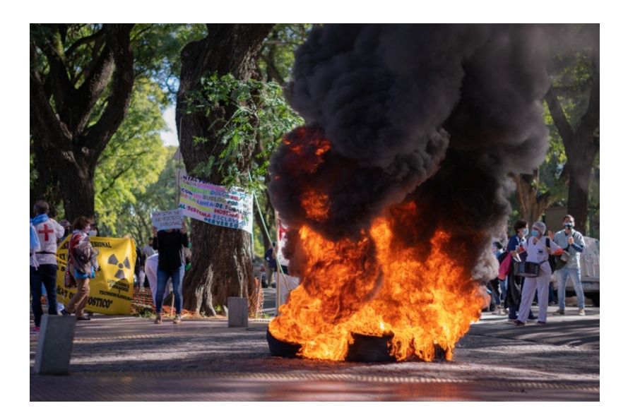
Figure 1: May 2021. International Nurses Day and protests in the City of Buenos Aires.

During the initial stages of the pandemic, it was quite dynamic; then, when the fear started to calm down a little bit, everything became more complicated, and you had to talk to the supervisor, the supervisor had to talk to the head of supervisors and to the doctors, to see if everyone was in agreement. It was a continuous tug-of-war. It was not easy.