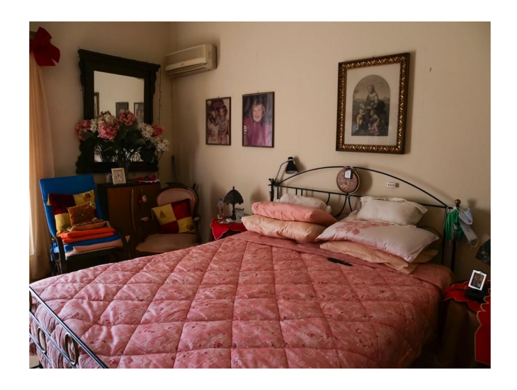
Tatiana's room-home. January 2024.