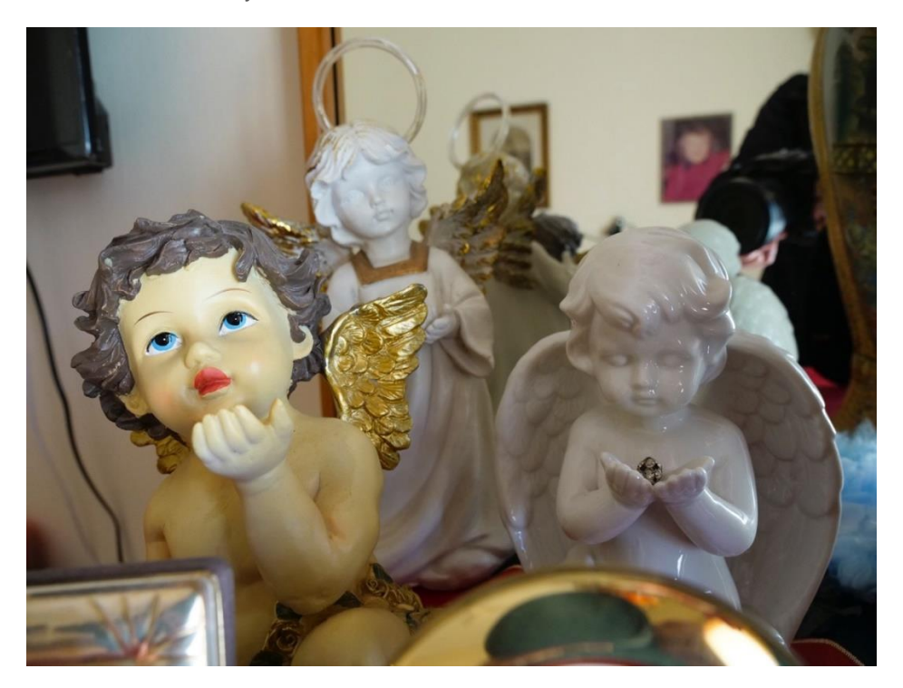
Little objects from Tatiana's old house around her room-home. January 2024.