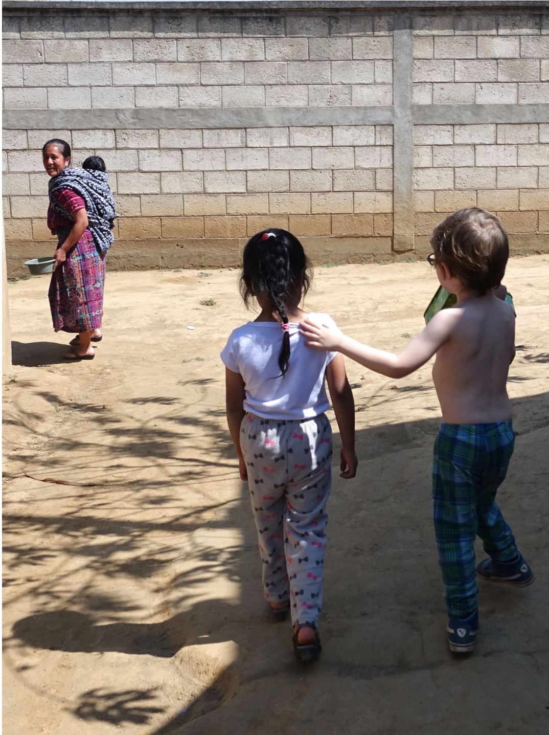
12. My son puts his hand on the shoulder of a playmate in highland Guatemala. He speaks Dutch and English and she speaks Mam and Spanish but they nonetheless play together for hours.