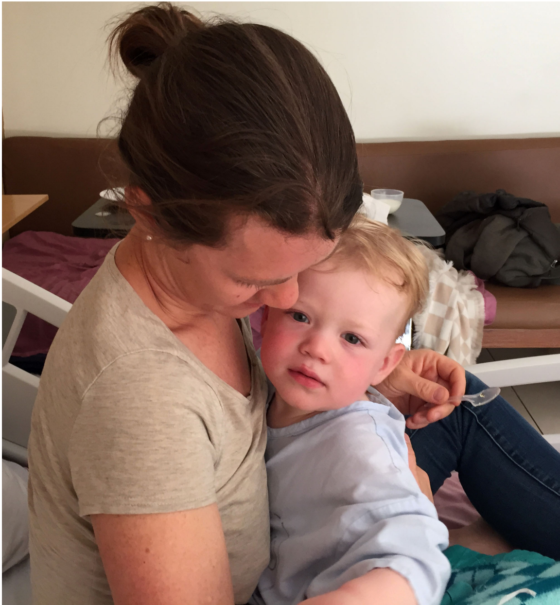
2. My son and me in the hospital recovery room, the day after his accident.

Both of my sons, now ages four and seven, have been sick in Guatemala. Coughs, rashes, the flu, and worse. Kind men and women have made them tea for upset stomachs or brought them damp cloths for their fevers. When my younger son was one, he had an accident, falling down our apartment stairs. He knocked out his teeth, crushed his lower jaw, and needed surgery. Guatemalans we barely knew ushered us to the hospital. While we were there, people checked in with us frequently to make sure we had everything they could provide. One man