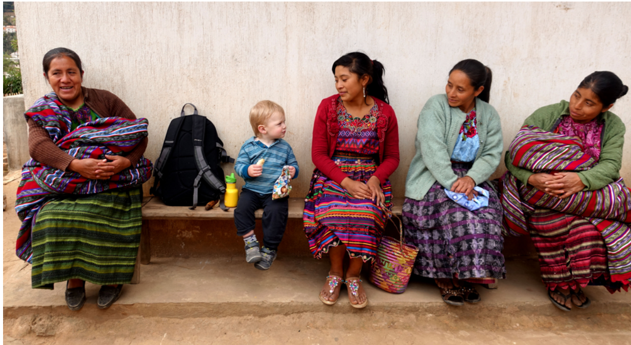
5. My son sits with a group of Mam-speaking women in highland Guatemala.

Guatemalan children arriving at the US border face a different reality. Applying for a visa to visit the United States from Guatemala is expensive and, unless families are very rich, the application will be denied. As a result, children are smuggled across Mexico, walking for long and uncertain days on bruised and calloused feet to desolate or disorganized points of entry. Upon arrival, their pleas to enter are typically rejected.