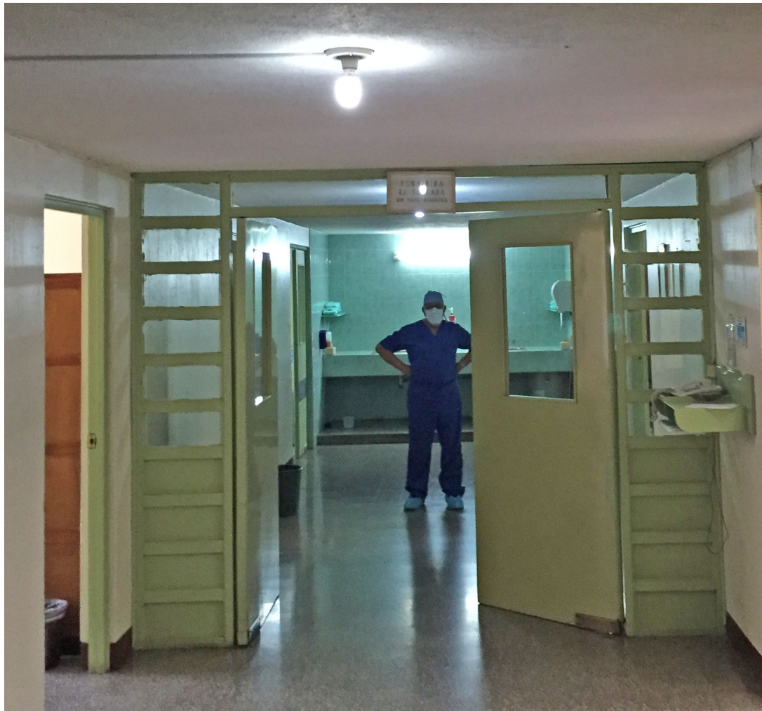
1. A medical assistant in highland Guatemala looks back at me as my son is wheeled to surgery.