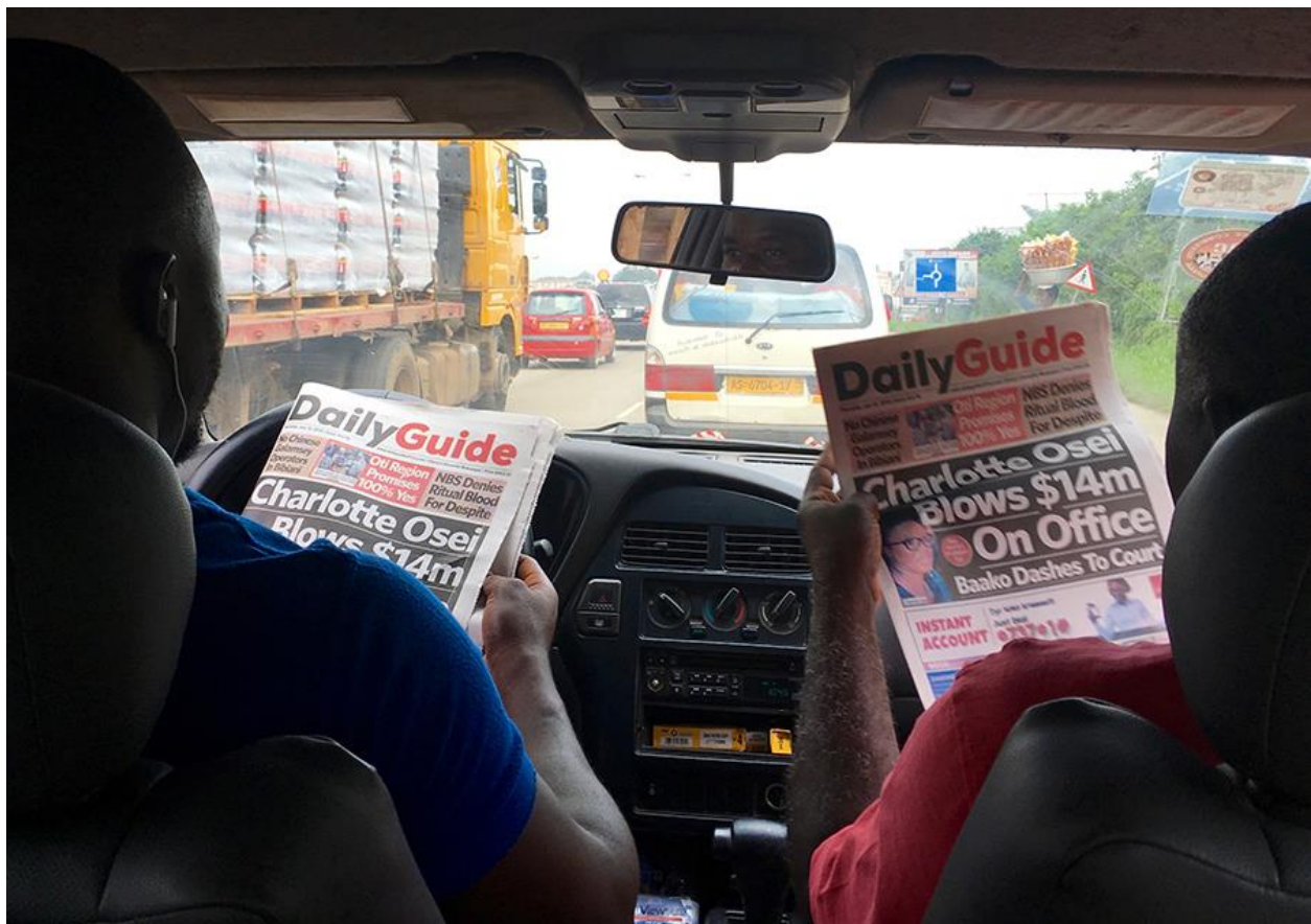
4. Reading the paper, Kumasi. Ashanti Region, Ghana, 2018.

Laboratory technicians in these areas show great dedication to their jobs. At the SDA's remote location, forty-five minutes to an hour off the main roads in Kumasi, it is difficult to maintain an adequate supply of agar plates. Knowing this, one of the few microbiologists at this hospital came in during his honeymoon to create blood agar plates from scratch. The agar dishes, while occasionally bought in well-funded hospitals, are prepared in the laboratory within Asamang's SDA hospital. The laboratory technicians perfect this task by using protein, salts, and agar mixes to create environments suitable for culturing bacteria. These mixes are placed in old glass Pepsi bottles and then autoclaved in a pressure cooker. The molten agar is then poured into plates on the microbiology lab table until each dish contains its allotted amount. This procedure is completed once every week or two, depending on need.