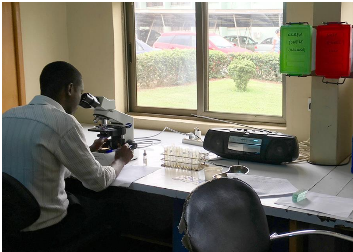
6. Analyzing a blood smear for malarial parasites, Kumasi South Hospital. Agogo-Kumasi, Ashanti Region, Ghana, 2018.

Per national protocol, potential blood donors must have a sample of their blood tested for viral pathogens, such as HIV. Outside the testing room on one ordinary weekday at the SDA hospital in Asamang, twenty patients are waiting to have their blood sampled for testing. Laboratory technicians receive on-site training in areas of need to ensure that they are able to efficiently complete the work. A recent university graduate (in the white coat), completing her national service in rural Ghana, studies the skill of sampling blood. The technician-in-training and her teacher will spend their entire day drawing samples from fifty to seventy patients who will need various forms of testing for their hospital stay or who wish to donate blood for a relative. The blood is tested for viral pathogens, and individuals are questioned to ascertain if they may have malaria, but they do not receive diagnostic testing for the blood-borne parasite, differing from some WHO recommendations. Clinicians at both hospitals believe that treating the disease based on the presentation of symptoms saves diagnostic tools, as a majority of the population has a built-up immunity to mild infection.