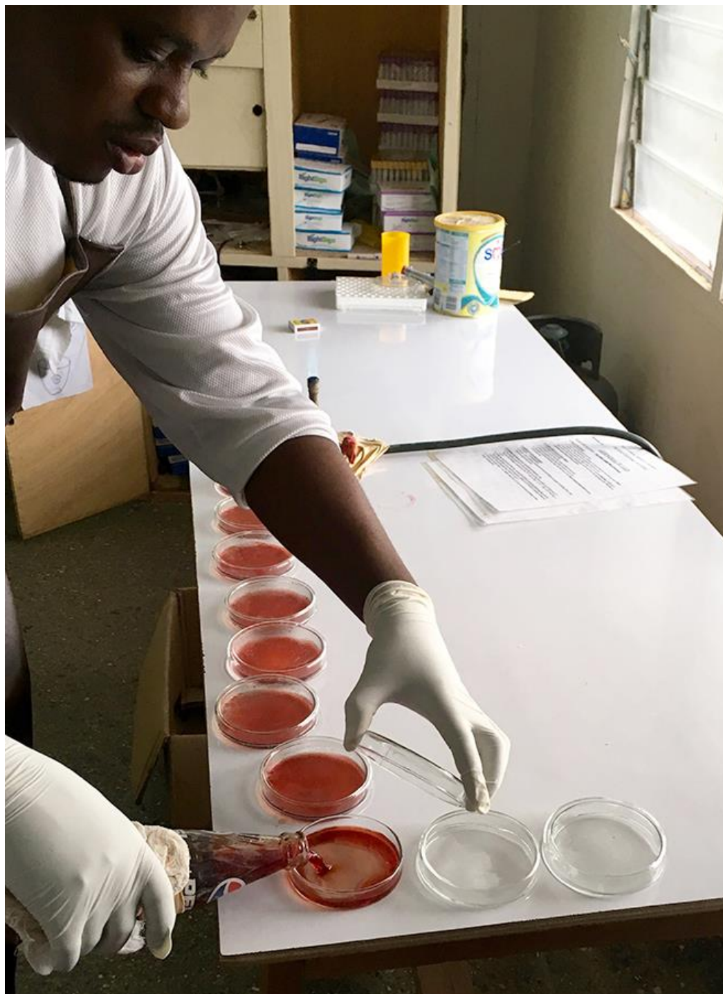
3. Creating agar plates, SDA Hospital-Asamang, Ashanti Region, Ghana, 2018.