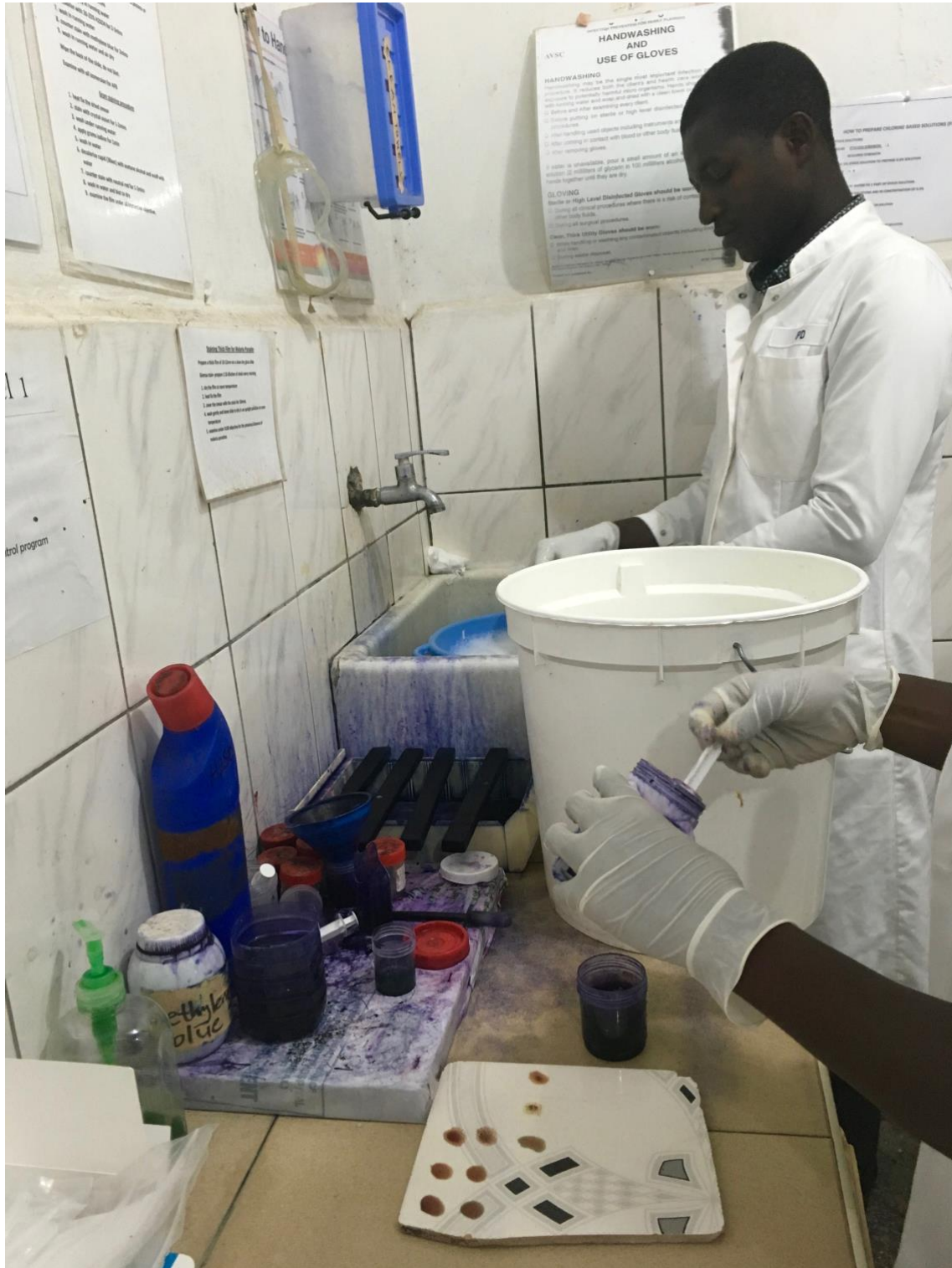
1. Blood grouping and staining, Seventh-day Adventist Hospital-Asamang. Ashanti Region, Ghana, 2018.