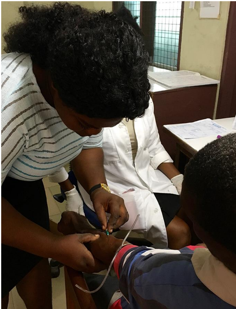
5. Taking blood samples, SDA hospital-Asamang. Ashanti Region, Ghana, 2018.

the local newspaper, which reported a denial by Ghana's National Blood Service (NBS) that they had provided tainted blood to patients. A prominent evangelist had alleged on social media that in the process of conducting a community outreach event, blood donated by Despite Group of Companies, a Ghanaian media conglomerate, went to 'spiritual rituals' instead of transfusions. Damaging accusations such as this can lead to public mistrust of the NBS. These charges were completely false, and were debunked by the NBS in the DailyGuide . Already facing blood shortages around the country, the NBS strives to encourage citizens to donate blood by assuring participants that the donation will be used for medical purposes only.