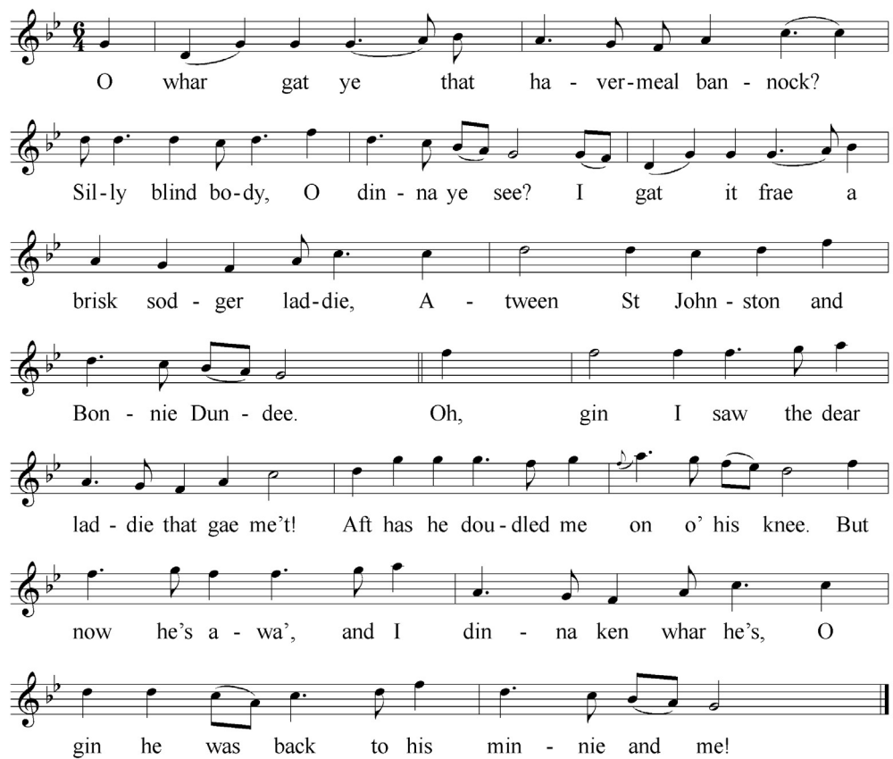
Figure 1: 'Bonnie Dundee'.